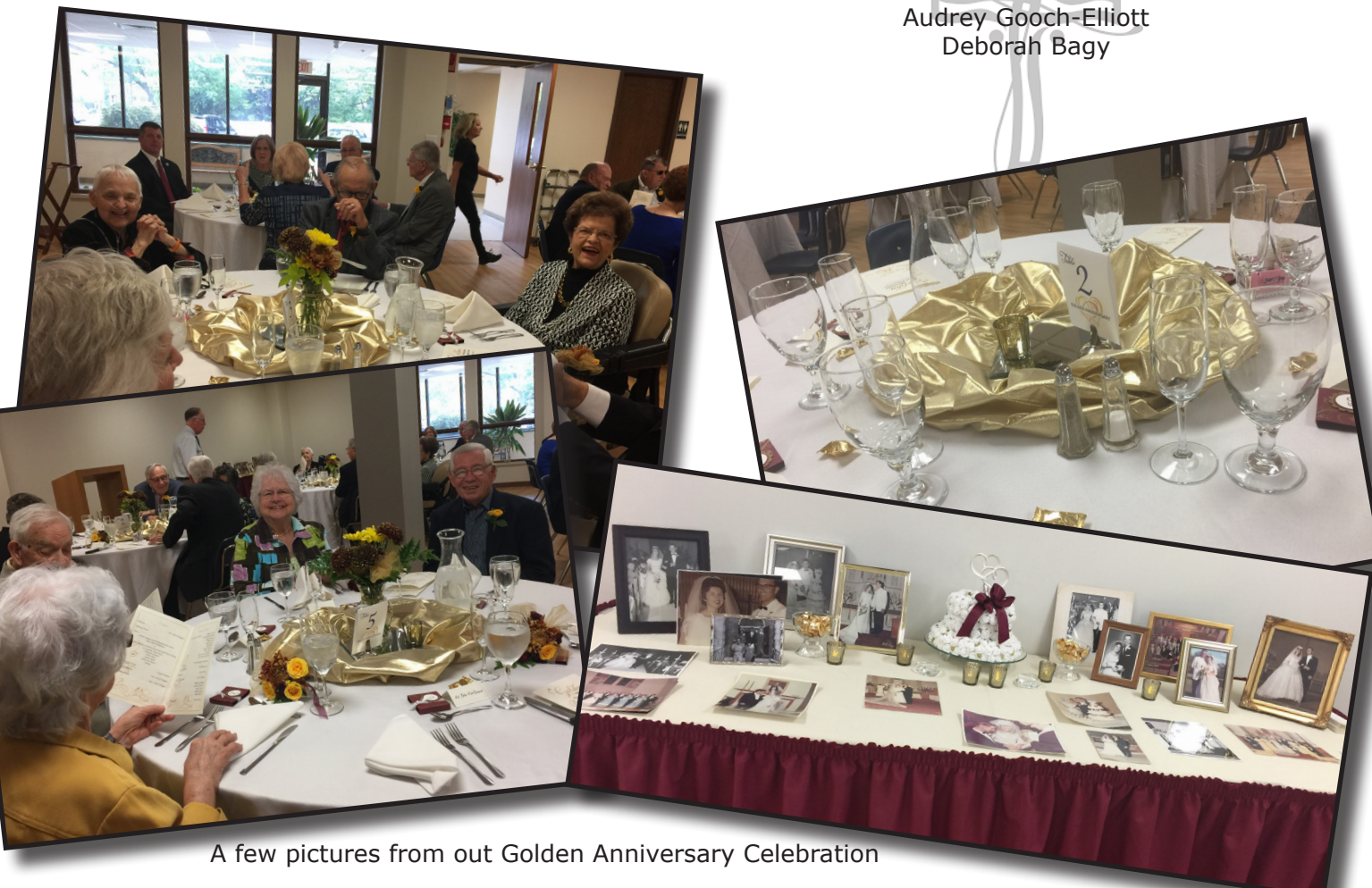
A few pictures from our Golden Anniversary Celebration